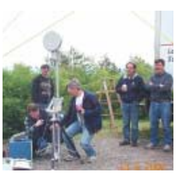
How many Packrats to make a 47G QSO?

Total 1882 3005 X 339 = 1,018,695 final score